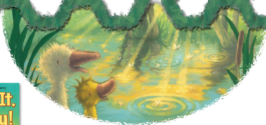
Illustration © 2009 Rebecca Harry.